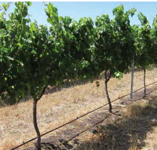
Compost application at Margaret River trial site.

In summary, you can use compost as mulch but you cannot use mulch as compost . This distinction might seem trivial, but it is important to understand in order to make an informed decision on the suitability of a particular product for a particular task.