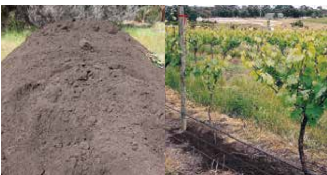
Figure 3: Composted materials are generally finer in texture than mulch and are applied at shallower depths to ensure water infiltration is not impeded.