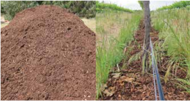
Figure 2: Wood chippings banded undervine are becoming popular as mulch.

For finer-textured composts, aim to achieve a depth of about 25 mm (no greater than 50 mm) and a band width of at least 500 mm (Figure 3).