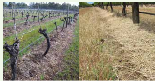
Figure 1: Cereal straw banded undervine (a) and cover crop slashings side-thrown undervine (b) can be used as mulch.

For coarse-textured mulches, aim to achieve a depth of about 50–75 mm (no greater than 100 mm) and a band width of at least 500 mm (Figure 2).